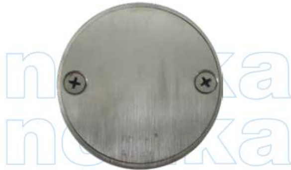
SS CRGN8050HLNH (NO HOLE)