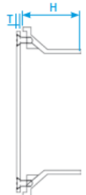
CROSS SECTIONAL VIEW